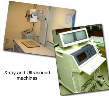
X-ray and Ultrasound machines

Cancer is often suspected from clinical signs, particularly physical examination by your veterinarian. X-rays and ultrasound are often helpful to detect tumors. Blood samples may indicate anemia but this is not specific and only a few tumors will have cancer cells in the blood.