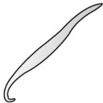
Hookworm (5x actual size)

Since the dog's environment can be infested with hookworm eggs and larvae, it may be necessary to treat with chemicals to remove them from your yard. We can offer recommendations for grass-friendly products.