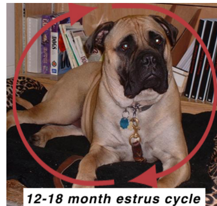
12-18 month estrus cycle

There is no evidence that irregular heat cycles predispose the dog to false pregnancies or pyometra (uterine infection). Small breeds tend to cycle more regularly than the larger breeds. Three and occasionally four heat cycles per year can be normal in some females.