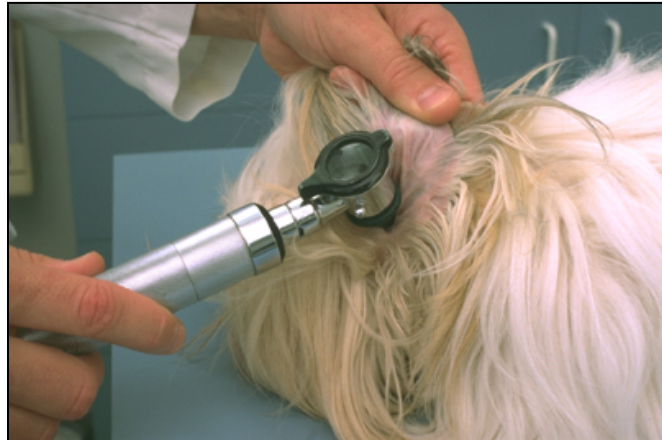
Otosopic exam of ear canal.

An important part of the evaluation of the patient is the identification of underlying disease. Many dogs with chronic or recurrent ear infections have allergies or low thyroid function (hypothyroidism). If underlying disease is suspected, it must be diagnosed and treated or the pet will continue to experience chronic ear problems.